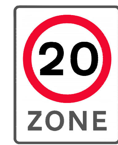
Ref 1 TSRGD 674