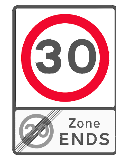
Ref 2 TSRGD 675