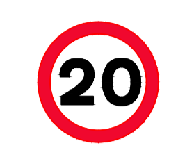
Ref 3 TSRGD 670 300mm dia