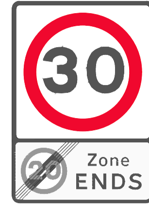
Ref 2 TSRGD 675